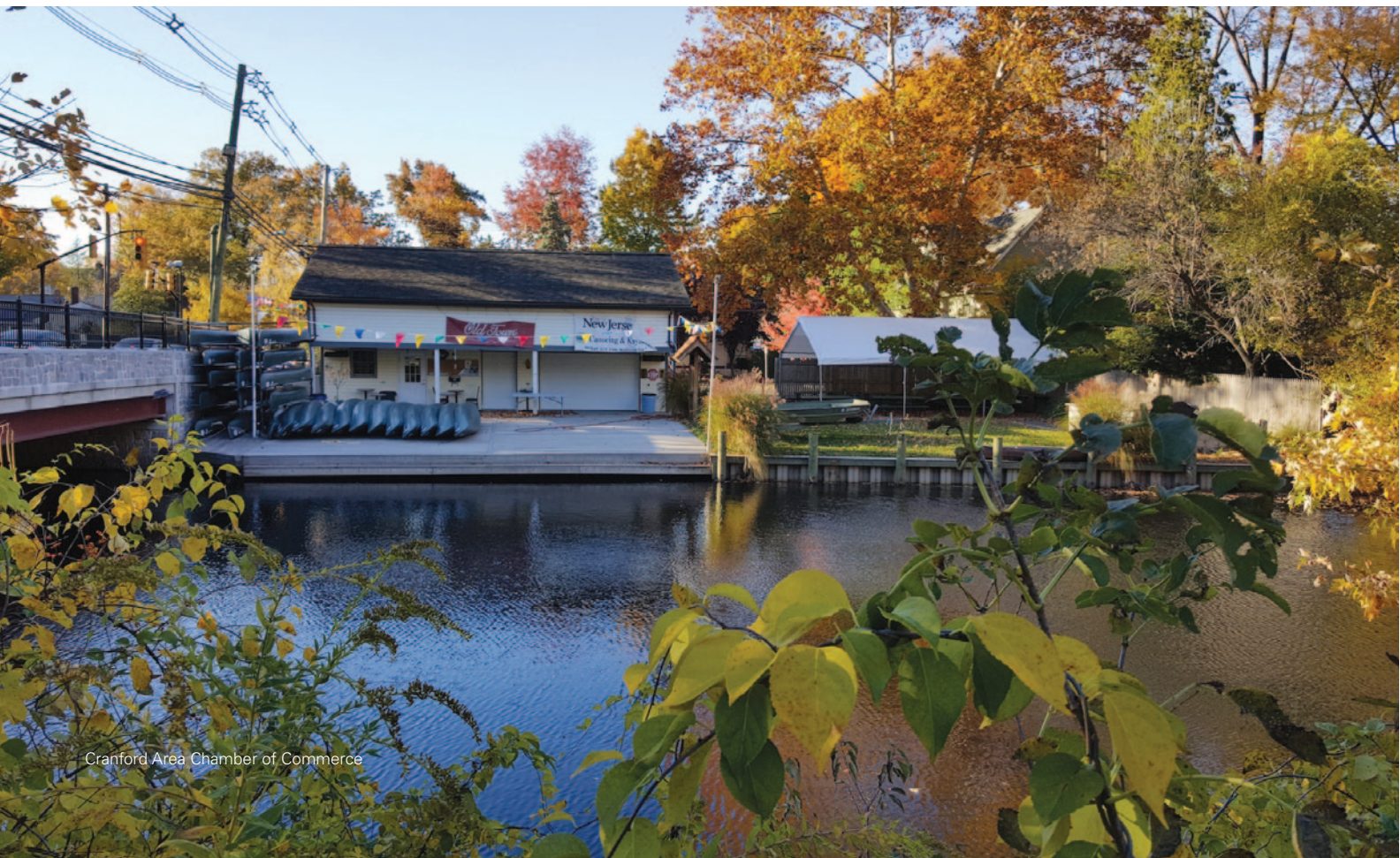
Cranford Area Chamber of Commerce