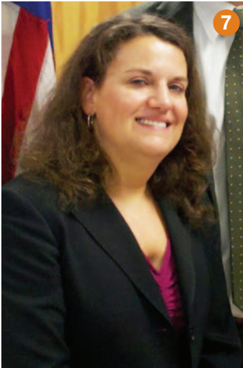
Rotary Club of Cranford